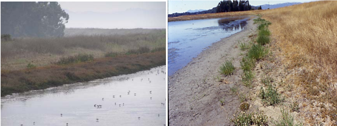
2.4. Weed-dominated levees, tidal marsh restoration site: Sonoma Baylands, Sonoma Co. northern levee around winter solstice, December 2003: annual weeds, dead in winter, dominate levee above high tide line (steep, abrupt, narrow gumplant/pickleweed gradient), and provide minimal cover during extreme high tides. Right: Annual nonnative grasses and weedy forbs dominate levee above narrow, linear strip of high tide line vegetation (pioneer pickleweed and gumplant), one year after tidal restoration (August 1997).