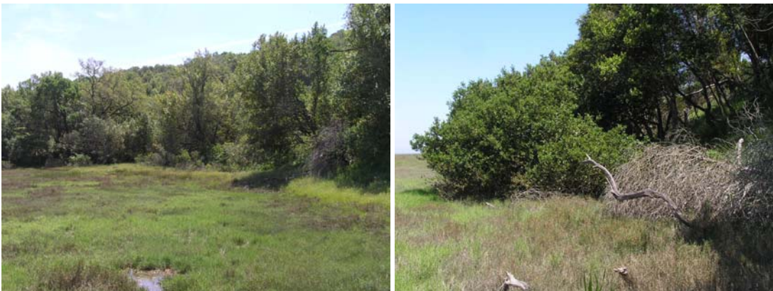
3f. China Camp , San Rafael, Marin County— hillslope, oak woodland and mixed evergreen forest ecotone with tidal marsh includes wire and Mexican rush, meadow sedge, and creeping wildrye. Note scarcity of gumplant.