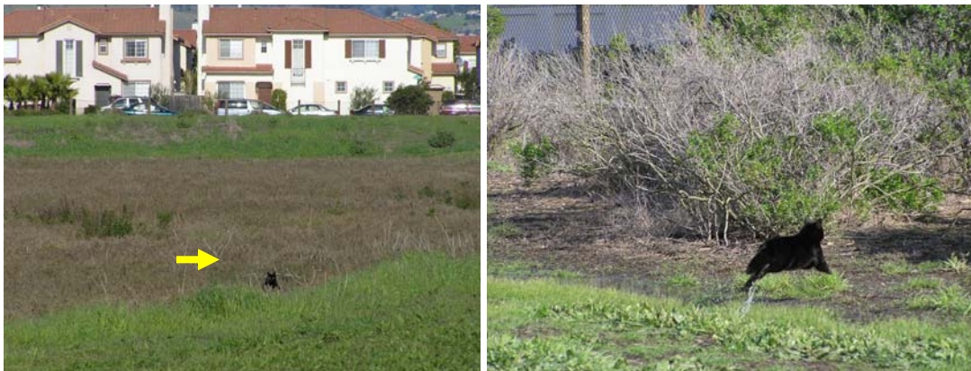
2.2. Feral predator (domestic cat) moving between non-native grassland/tidal marsh edge (foraging) and cover of adjacent scrub, Roberts Landing, San Leandro, Alameda Co. 2006 .