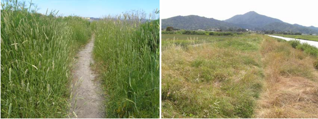
2.5. Weed-dominated levees: tidal marsh restoration site: Muzzi Marsh, Corte Madera, Marin Co. Left: Harding grass and fennel form solid, dense, tall stand broken by foot-trail; 2006. Right: wild oat, wild radish, Italian ryegrass form low, grassy, weedy cover inhibiting native vegetation, and providing little winter high tide cover.