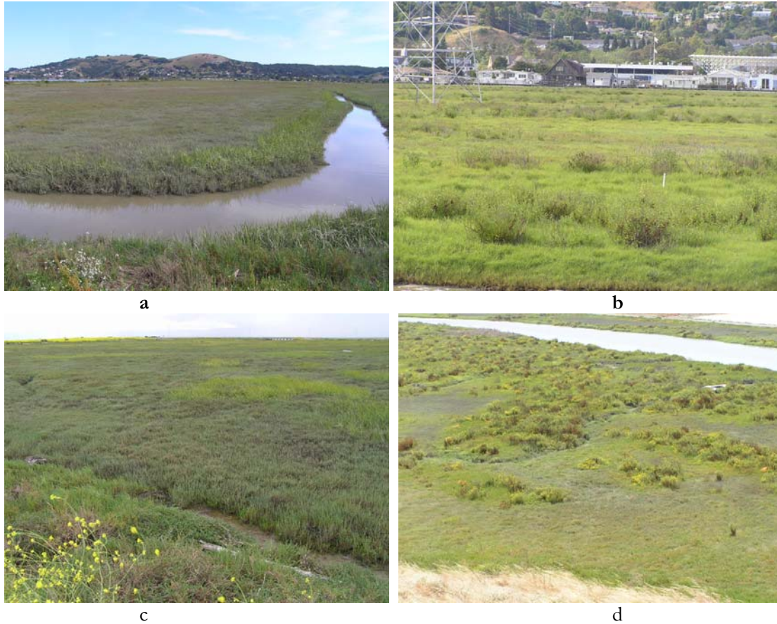
1a. Contrasting distribution of gumplant vegetation within old and young tidal marshes.

(a) Muzzi Marsh, Cortes Madera, Marin County ; view to south from north end. Homogeneous pickleweed vegetation in middle marsh plain on former dredge sediment terrace; tidal channels support little gumplant along high marsh banks. Narrow, concentrated gumplant zone is limited to high tide line of dikes (see also figure 6).