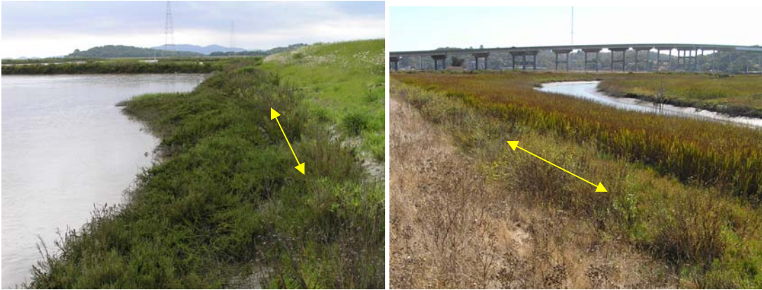
Figure 6. Levee-edge gumplant . Linear, tall stands of gumplant (yellow arrows) develop artificial “hedge” patterns along the high tide shoreline of levees in some restored tidal marshes, even where marsh plain development is too immature to support gumplant along tidal creek banks. Tidal marshes with natural terrestrial soil edges, in contrast, seldom if ever develop such extensive, dense stands of gumplant; see Figure 3). Right: Sonoma Baylands, 2005; Left: Carl’s Marsh, 2005 (San Pablo Bay, Petaluma River mouth vicinity, Sonoma Co.)