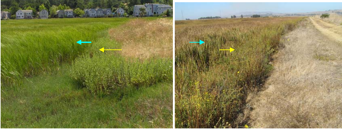
Figure 5. Alkali-bulrush ( Bolboschoenus maritimus ; blue arrow, above left) forms tall, dense, persistent shoot canopies within brackish marshes of the western Estuary, providing high tide cover within the marsh plain (sometimes higher and denser than gumplant canopies along adjacent terrestrial edges of marsh [yellow arrow]; see above, left; Bahia, Novato, Marin Co, 2005). The alkali-bulrush foliar canopy may be partially or fully submerged by extreme high winter tides or storm surges.