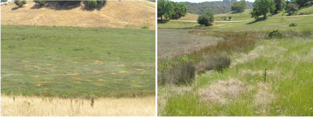
3d. China Camp , San Rafael, Marin County— hillslope grasslands and rush-grass tidal marsh ecotone ( Juncus arcticus / Leymus triticoides / Distichlis spicata ) along prehistoric salt marsh edge. Note relatively sparse distribution of gumplant compared with tidal creek banks, and sparse shrub cover at and above the high tide line.