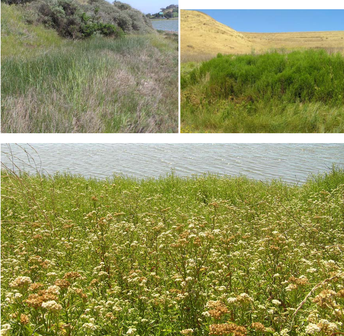
3.g. Coyote Hills, East Bay Regional Parks District. Historic bay edge along salt ponds retains tidal marsh terrestrial ecotone vegetation along saline wetland border of salt pond and seeps. Upper left: mixed mexican rush ( Juncus arcticus var. mexicanus ), creeping wildrye ( Leymus triticoides ) and saltgrass ( Distichlis spicata ) ecotone below coastal sage scrub ( Artemisia californica , Baccharis pilularis ) on steep hillslopes. Upper right: western goldenrod ( Euthamia occidentalis ) and creeping wildrye dominate swale seep continuous with historic tidal marsh edge. Bottom: nearly monotypic clonal stand of marsh baccharis ( Baccharis douglasii ) dominates lower end of natural swale grading down to historic tidal marsh (modern salt pond) edge.