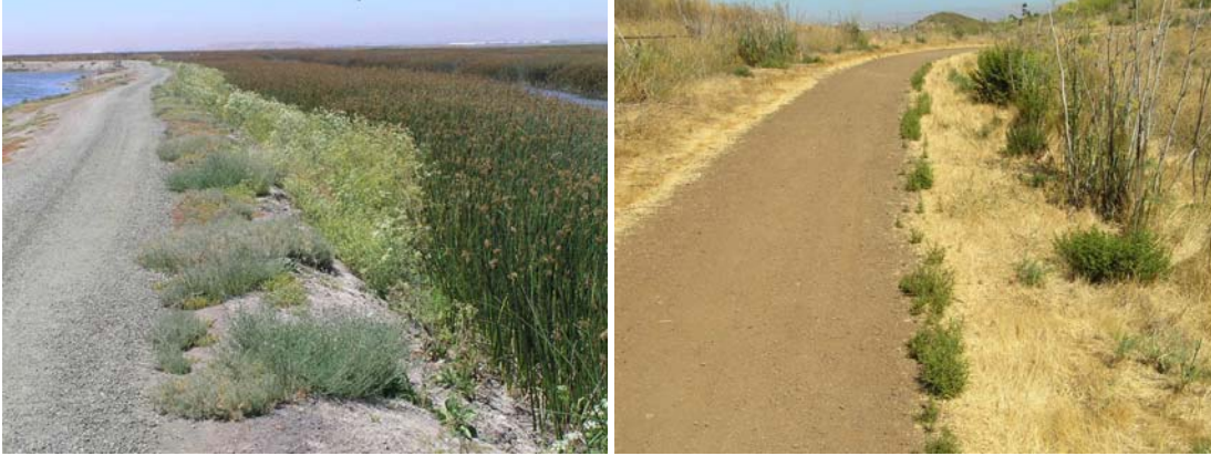
2.3. Road/trail weed corridors adjacent to tidal marshes. Left: Artesian Slough levee, Alviso (San Francisco Bay National Wildlife Refuge) with narrow strip of bassia and poison-hemlock tracking previous year's maintenance disturbance; August 2006. Right: Stinkwort ( Dittrichia ) disperses in a linear colony along the edge of a foot trail above the bay, Coyote Hills, Fremont (East Bay Regional Park District); August 2006.