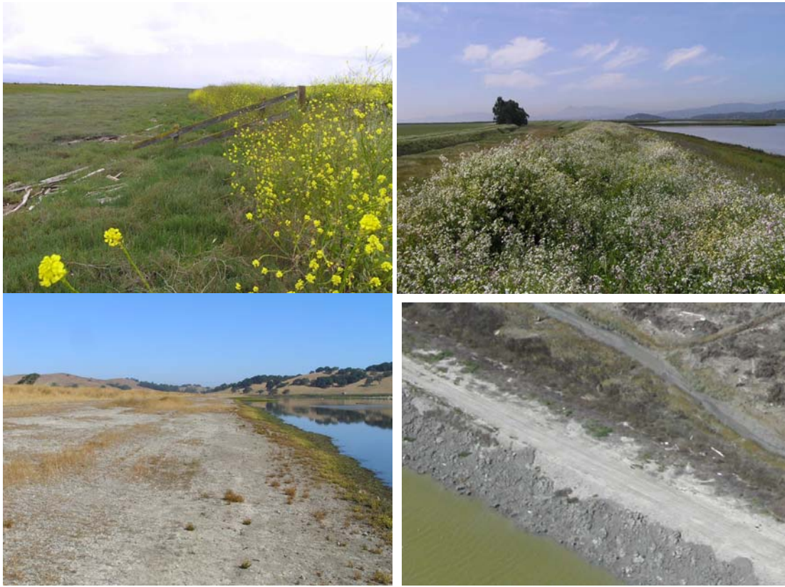
Figure 2.1. Bay levee vegetation conditioned by past disturbance of maintenance or original construction: (a) black mustard-dominated levee, Cogswell Marsh, Hayward, Alameda Co., 2005 (b) wild radish-dominated levee, east end Sonoma Baylands, Sonoma Co., 2005 . (c) first-season vegetation (annual grasses above shoreline) on engineered levee, Petaluma Marsh Enhancement Project, Novato, Marin Co., 2006 . (d) raised/upgraded levee, Whale's Tail Marsh mitigation site, Hayward, Alameda Co., 2005 ., mixed salt marsh and non-native weeds, bare soil.