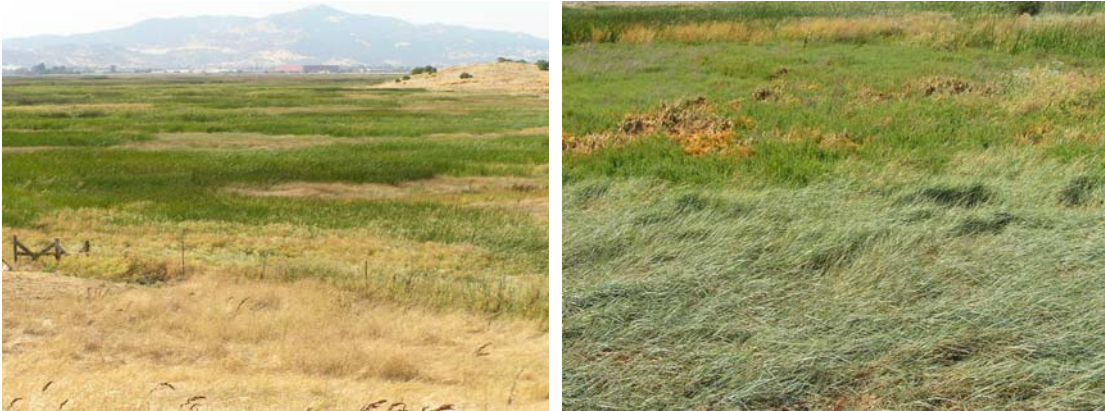
3a. Rush Ranch , Solano County (Suisun Marsh) – hillslope, grassland. Left: arid, wind-exposed grassland hills of old ranch lands grade into brackish tidal marsh; minimal scrub or gumplant. Right: native creeping wildrye has regenerated dominant stands intergrading with tidal marsh where grazing has been excluded. August 2005.