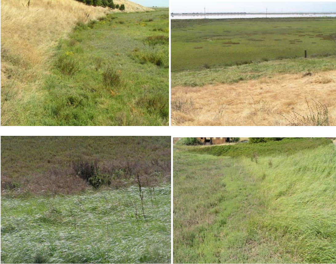
3.f. Upper Newark Slough , Don Edwards San Francisco Bay National Wildlife Refuge, Franciscan hillslope. Upper left, steep hillslope, non-native grassland near sea level, coastal scrub above (dark shrubs in background are non-native Acacia ); Upper right, lower left: native creeping wildrye (green) below annual grasses (straw) locally dominates pickleweed tidal marsh edge on gentle hillslope toe. Lower right: dense creeping wildrye (foreground) and California blackberry (background) on hillslope with seeps intergrade sharply with alkali-heath and pickleweed high salt marsh. Note absence or scarcity of gumplant.