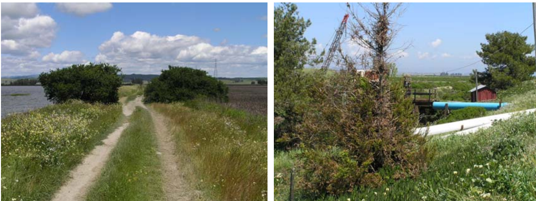
2.6. Salt-intolerant trees grow and persist on levees adjacent to saline tidal wetlands, indicating physiologically insignificant salinity in deeper soil horizons of bay mud levees. Fresh groundwater lens likely occurs in most levees. Left: two vigorous mature coast live oak-canyon oak hybrid intermediates (bearing acorns), growing on levee separating brackish tidal marsh and brackish seasonal pond, Bahia, Novato, Marin Co.; April 2006. Right: Monterey pine (healthy) and redwood (dieback; injured by salt spray at the bay edge) from old abandoned ranch house plantings persist without irrigation on levee adjacent to San Pablo Bay at Sears Point, Sonoma Co., June 2005.