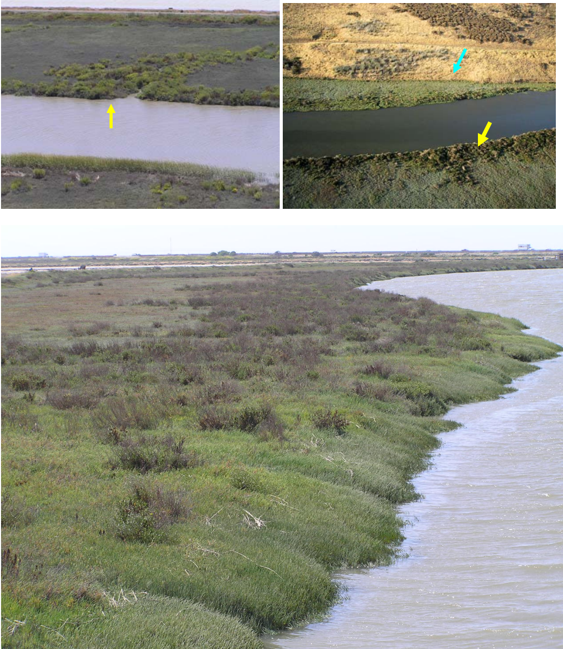
Figure 4 Tidal creekbank gumplant vegetation Upper Newark Slough prehistoric marsh, San Francisco Bay National Wildlife Refuge.. Upper left: gumplant ( Grindelia birsutula , syn. G. strica var. angustifolia ) traces the outline of tidal creeks and sloughs, providing local high tide refuge within the marsh plain, for resident marsh wildlife. The gumplant canopy is submerged by extreme high winter tides or storm surges. Upper right: Note concentration of gumplant along slough banks (yellow arrow) compared with natural terrestrial edges of salt marsh (blue) with relatively sparse gumplant cover. Bottom: high tide cover provided by gumplant is concentrated along banks of small drainages and large sloughs, away from the terrestrial edge.