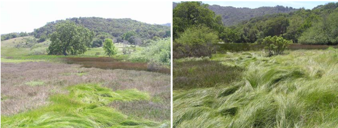
3e. China Camp , San Rafael, Marin County— alluvial fan, grassland and riparian woodland ecotone with brackish tidal marsh (foreground: meadow sedge). Note absence of gumplant where sod-forming sedge stands occur.