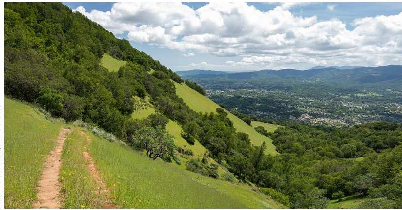
Matthew McClain, CCA-SA 4.0

With so much wildland adjacent to people's homes and businesses, we must learn to reduce the risk from wildfires and, at the same time, preserve the habitats and wild things that we love. (Pictured, Mt. Burdell)