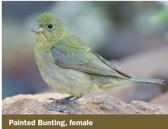
Painted Bunting, female