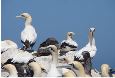
Northern Gannets, a species of the open ocean

“State of the Ocean” science talks are informational and inspirational presentations on the latest scientific understanding of the ocean. The talk will cover pertinent and timely topics of ocean issues that are both of global interest and that directly impact our northern California waters. Globally, we will explore the impact of plastic in the oceans and the myriad of ways that climate change is changing ocean ecosystems. Regionally, we will understand how current and past ocean conditions have led us to local fishery closures and explore what kind of ocean ecosystem we can expect in the future.