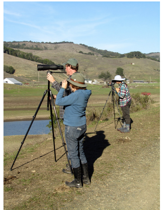
Some of the Hicks Valley team counting birds on the Soulajoule Reservoir and adjacent ranchlands during the Cheep Thrills Christmas Bird Count on December 14