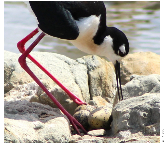
Black-necked stilt at a nest

Nesting Black-necked Stilts first returned to our marshes in the mid-1960s, followed by American Avocets in 1984. In 1996, Forster's