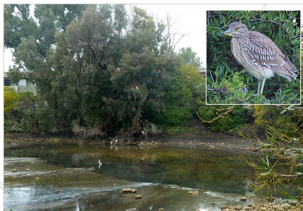
The Corte Madera Inn pond with an immature Black-crowned Night-Heron roosting (pictured in insert)

As required by CEQA, the DEIR presents three other alternatives and evaluates the