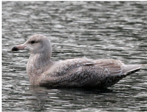
Greg G. Schechter

Much more unexpected for late winter was a Palm Warbler at Las Gallinas on the 8th, likely wintering in the area. The continuing Eurasian Green-winged Teal was also still present there (BB).