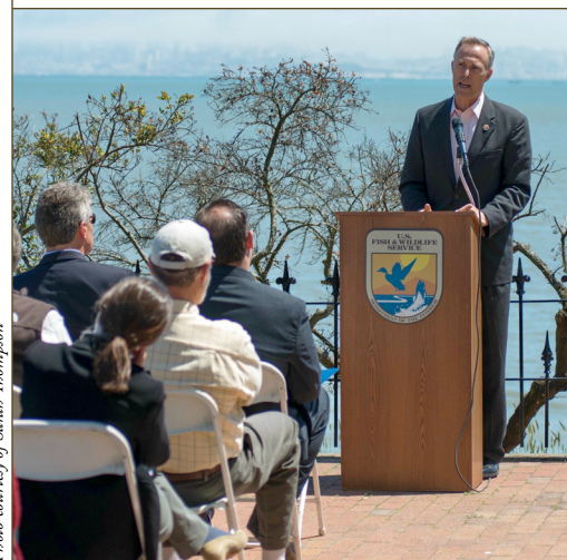
Congressman Jared Huffman addresses the crowd at the Ramsar Celebration