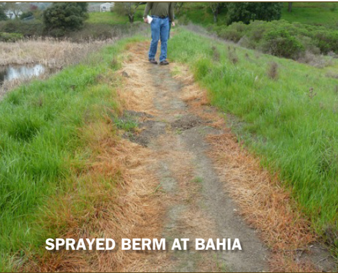
SPRAYED BERM AT BAHIA